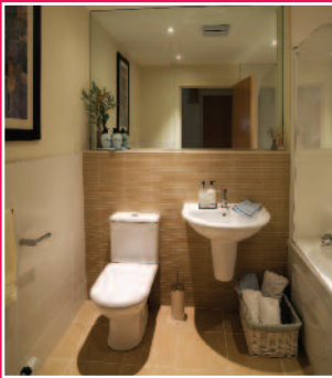
Actual Redwoods Interiors.